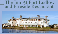
The Inn At Port Ludlow and Fireside Restaurant