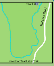
Insert for Teal Lake Trail